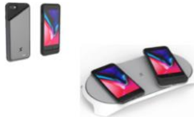
SkyCurrent III: Dual Mode Wireless Charging

PowerSphyr's SkyCurrent III is the ultimate wireless charging platform delivering its dual-mode wireless charging pad and a suite of 'fast charging' battery cases. The charging pad delivers Airfuel's 'fast charging' magnetic resonant (MR) and supports Wireless Charging Consortium's Qi technology which is embedded in devices such as the Apple X and Samsung 9. Slip on PowerSphyr's battery case, shown below, to 'fast charge' up to 8 devices simultaneous at up to 12 Watts, or charge up to 3 Galaxy or iPhones at up to 7.5 Watts. The SkyCurrent III delivers the ultimate in x- and y-axis flexibility. Drop your PowerSphyr enabled wireless charger anywhere on the pad for the ultimate in 'drop & go' flexibility!