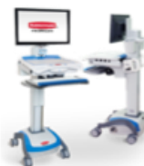
RF to DC Secure Charging

RF to DC secure charging to provide constant trickle charge capabilities with optimal spatial freedom of up to 12ft. The solution is capable of charging multiple devices such as key boards and monitors while harvesting existing radio frequencies.