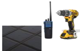
MR high powered wireless charging mat

High-performance wireless charging mat leveraging Magnetic Resonance (MR) fast charge capability. The solution is capable of simultaneously charging multiple devices across varying charging and power requirements from 500 Watts down to low milliwatts.