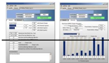
Integrated SkyCurrent Power Analyzer BMS

SkyCurrent Power Analyzer (SPA™) is an extensible battery management solution that provides precision monitoring and control of the complete battery charge process and lifecycle. The solution provides precision monitoring and control to monitor complete charge process.