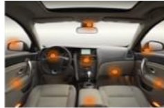
RF-Harvesting for IoT – LIDAR sensors

RF-Harvesting for IoT – LIDAR sensors provides optimal spatial freedom and support trickle charging for distances up to 12 ft.