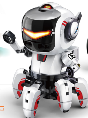
TOBBIE II CODING